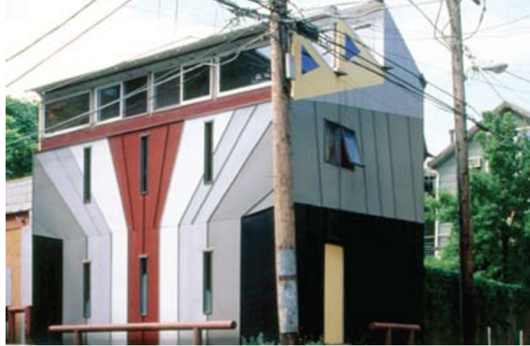
The structure was designed as a heat storage mass.