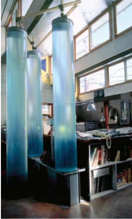
Five fiberglass tubes of water hold heat captured from sunlight.