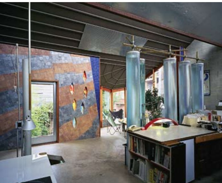
The building walls have an R-value of 31.7.